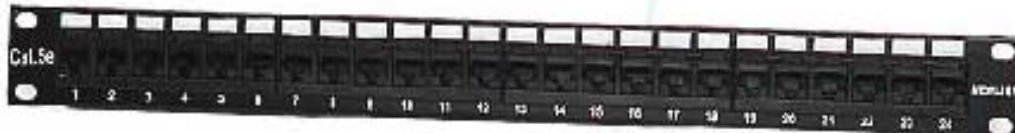
Part # 2594524

Lauro Aguirre No. 32-203 . Col. Agricultura . Mexico, D.F. 11360 www.peatsa.com Tels. 5342-1586 . 5341-8757 Messenger: redes_peatsa@hotmail.com contacto@peatsa.com